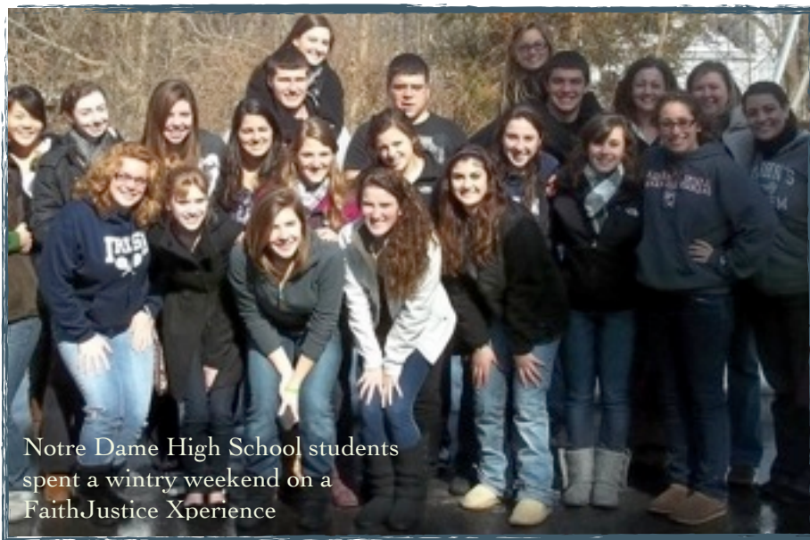
Notre Dame High School students spent a wintry weekend on a FaithJustice Xperience