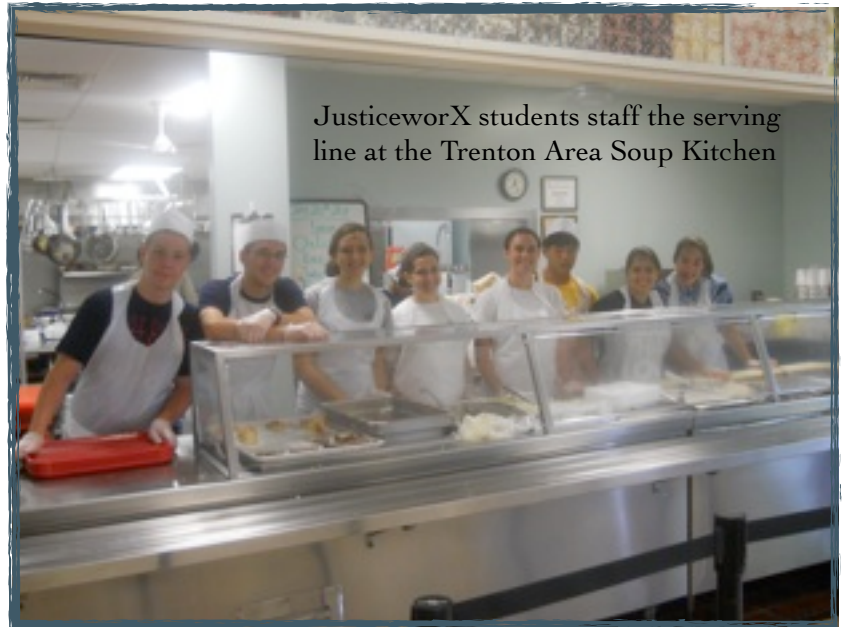
JusticeworX students staff the serving line at the Trenton Area Soup Kitchen