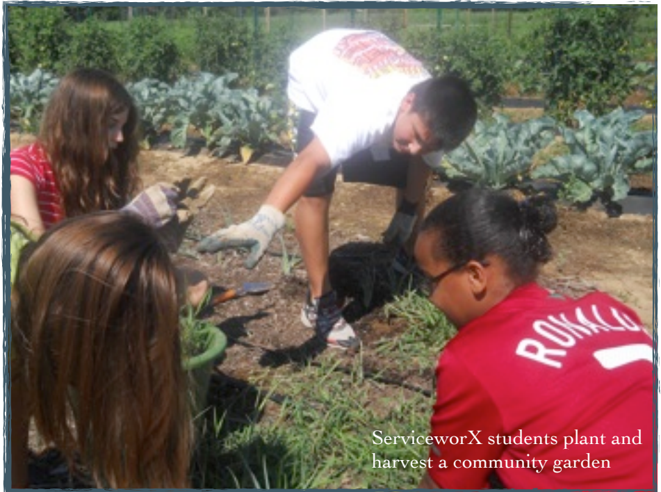
ServiceworX students plant and harvest a community garden